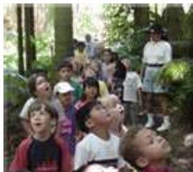
Resources for Filling the Pipeline with Future Engineers

As a service to our members we will provide links to ASHRAE articles on the topic discussed in our meetings.